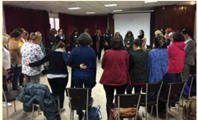
PNE women's group

We held the 14 th Annual Israeli-Palestinian Memorial Day Ceremony in partnership with Combatants for Peace. This joint ceremony in Tel-Aviv commemorates the loss of both Israelis and Palestinians. This year once again the Prime Minister of Israel decided to try to prevent the Palestinians from attending, and once again we went to the Israeli High Court and won - and nearly 9,000 people attended. The ceremony was broadcast in many countries, including the U.S.A., England and Germany. It is almost impossible to believe that when we started out with this ceremony over a decade ago, not more than 400 attended. This joint message of the result of the conflict resounds with even the toughest of folk.