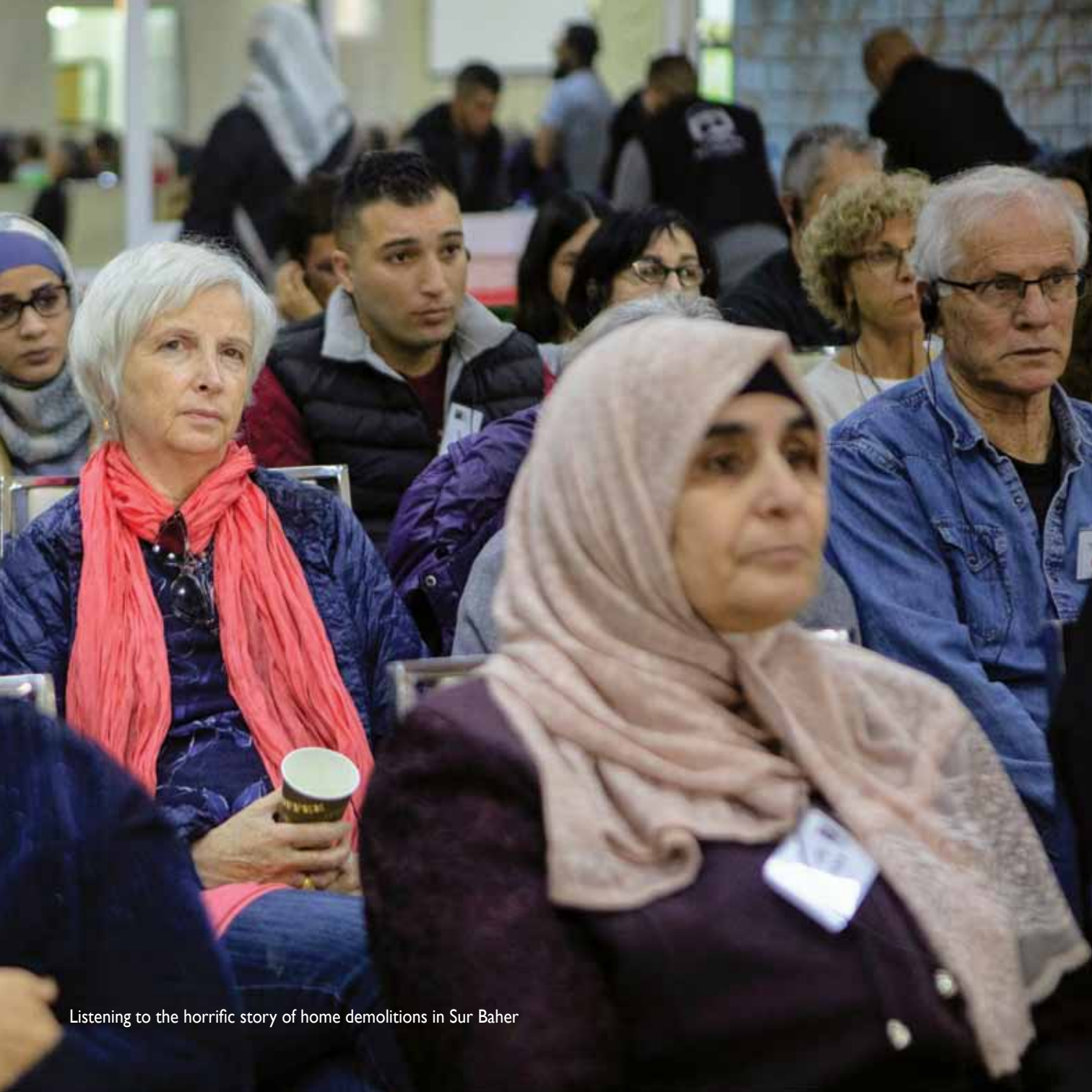
Listening to the horrific story of home demolitions in Sur Baher