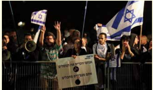
Demonstrators against the Memorial Ceremony